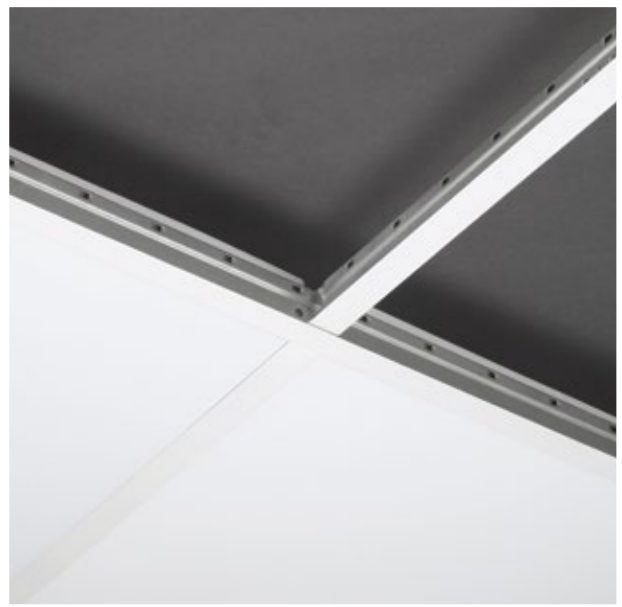
SONEX® Clean products are designed for environments that require excellent noise control across all sound frequencies using washable acoustic materials. Suitable for direct-apply, glue-up, suspended ceiling panel and baffle applications, the products are fully encapsulated in FR taffeta vinyl for efficient cleaning and long-lasting durability. SONEX Clean products meet USDA/FDA requirements.